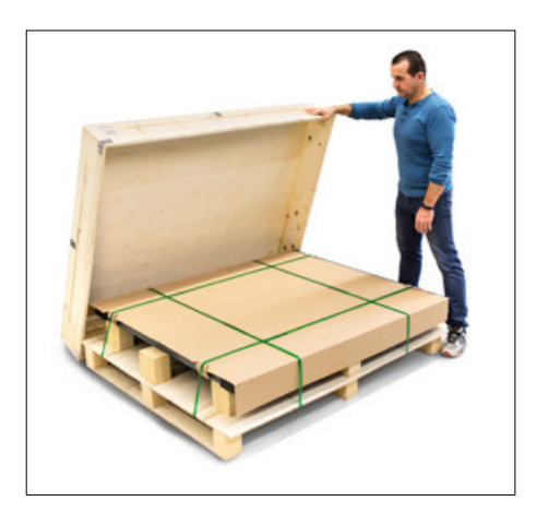
Did you know? Our floor scales are delivered in a robust wooden box. This protects the high-quality weighing technology from environmental influences and stresses during transportation. KERN – always one step ahead

Floor scale with EC type approval [M] and the best price-to-performance ratio – now also as high-resolution dual-range balance