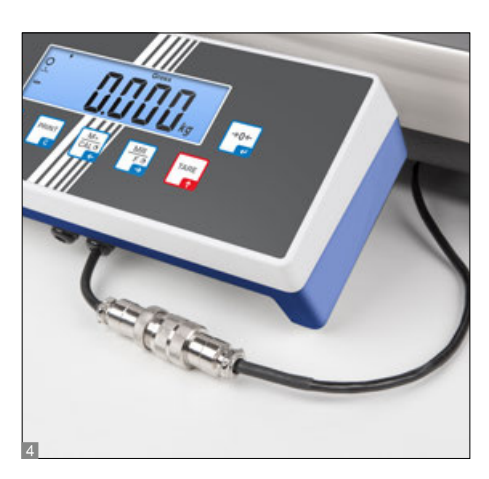
■ Verification plug, for verified balances this enables you to separate the display device and platform without affecting the verification, e.g. for installing the scale in a packing and dispatch table, pit frame etc. at a later date.